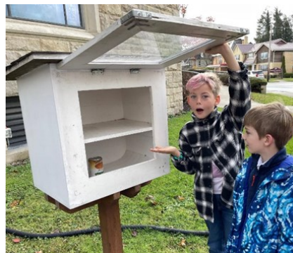
After the Sunday Service!!!