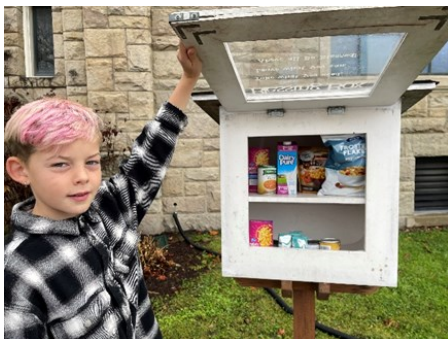
Before the Sunday Service

We continue to feed the hungry in our community as they certainly need our help.