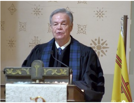
May 1 Scottish Heritage Day at First Presbyterian Church, Clarksburg, West Virginia