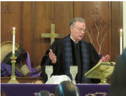
Ash Wednesday Joint service at Holy Trinity Lutheran Church