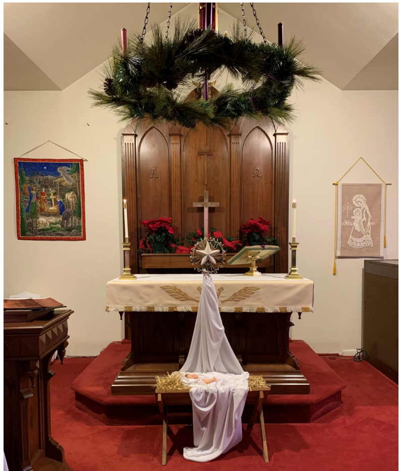
The Holy Trinity Lutheran Church celebrated the birth of Christ on Christmas Eve.