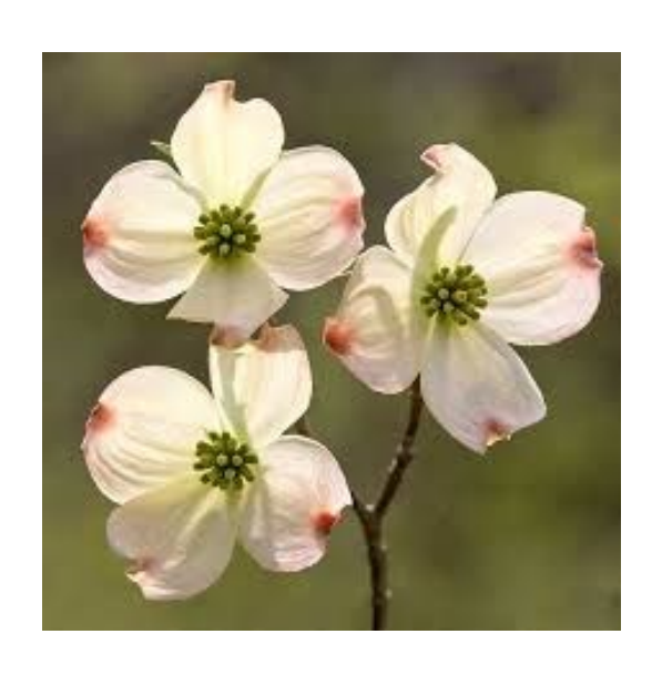
The Legend of the Dogwood

At the time of Crucifixion the dogwood had been the size of the oak and other forest trees. So firm and strong was the tree that it was chosen as the timber for the cross. To be used thus for such a cruel purpose greatly distressed the tree, and Jesus nailed upon it, sensed this. In His gentle pity for all sorrow and suffering Jesus said to the tree: