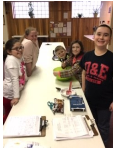
The After School Program children enjoy making cookies to celebrate another school year completed.