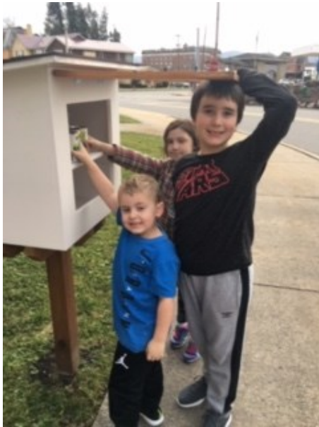
Kids from ASP helped stock the Blessing Box whenever needed.