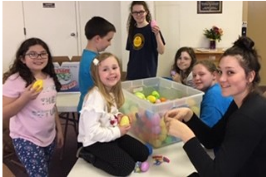
The children at the After School Program helped staff over 200 eggs for DMPC's Annual Easter Egg Hunt.