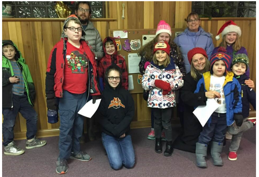
YOUTH GROUP IS READY TO GO CHRISTMAS CAROLING!