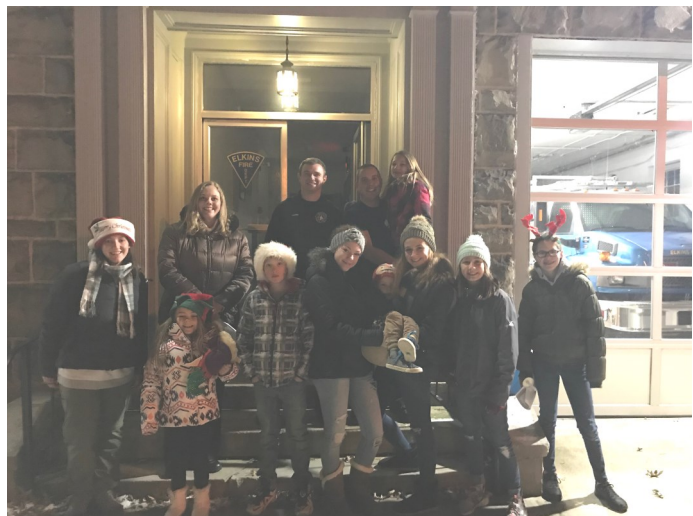
We stopped by the Elkins Volunteer Fire Dept. in December while we were out on our "Prayer Walk". We prayed that they would be given strength & courage to help them when they are called to an emergency situation.

April 8 6:00pm Regular Meeting April 22 6:00pm Regular Meeting